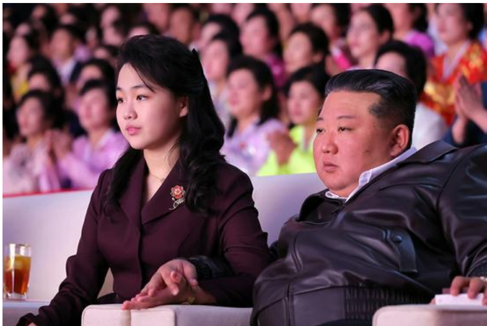
North Korean leader Kim Jong-un, right, and his daughter Kim Ju-ae, watch a performance marking International Women's Day on March 8 at Pyongyang Indoor Stadium, in this photo released the next day by the Korean Central News Agency.

Despite the rhetorical emphasis on women’s importance, structural gender disparities remain evident in North Korea’s political system , where female representation in core leadership bodies continues to be limited. The contrast between Seoul’s policy-oriented framing and Pyongyang’s ideological messaging underscores the broader divergence in governance approaches on the peninsula, even when addressing shared global themes such as gender equality.