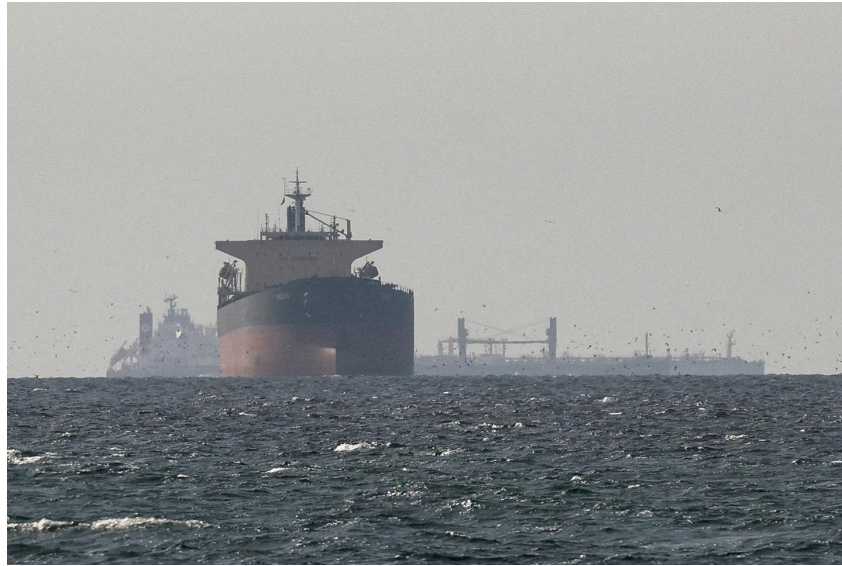
Tankers sail in the Gulf, near the Strait of Hormuz, as seen from northern Ras al-Khaimah, near the border with Oman's Musandam governance, amid the U.S.-Israeli conflict with Iran, in United Arab Emirates on March 11.