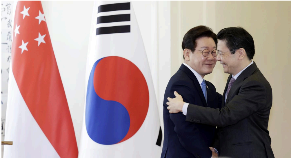
Korean President Lee Jae Myung, left, hugs Singaporean Prime Minister Lawrence Wong after their joint press briefing at the Foreign Ministry in Singapore on March 2.