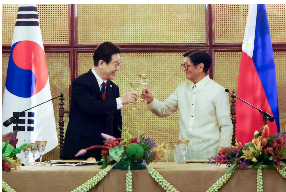
Korean President Lee Jae Myung, left, and Philippine President Ferdinand Marcos Jr. toast during a state banquet following their bilateral summit at the presidential palace in Manila on March 3.

Beyond economic and strategic considerations, the visit underscored longstanding historical ties between the two countries, commemorating the 77th anniversary of diplomatic relations. These include the Philippines' contribution during the Korean War, which continues to serve as a symbolic foundation for contemporary cooperation. Taken together, the visit reflects Seoul's broader effort to strengthen its engagement with Southeast Asia by integrating traditional security cooperation with emerging areas such as clean energy, advanced manufacturing, and digital innovation, positioning the Korea–Philippines partnership as an increasingly multifaceted strategic relationship.