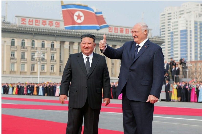
North Korean leader Kim Jong-un, left, and Belarusian President Alexander Lukashenko attend a welcoming ceremony for the Belarusian leader's visit to Pyongyang at Kim Il Sung Square on March 25, as seen in a photo carried by North Korea's official Rodong Sinmun the following day.

looks to diversify its partnerships. Observers suggest that this trilateral alignment could extend beyond economic cooperation to strategic coordination on global security issues, including potential support for Iran amid escalating Middle East tensions. Overall, the summit highlights a shifting geopolitical landscape, where isolated states are increasingly forming tighter alliances to counter Western influence.